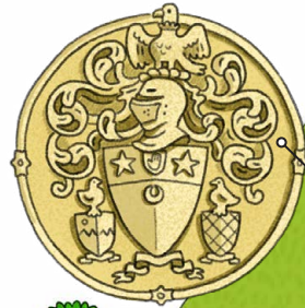
THE ST JOHN COAT-OF-ARMS